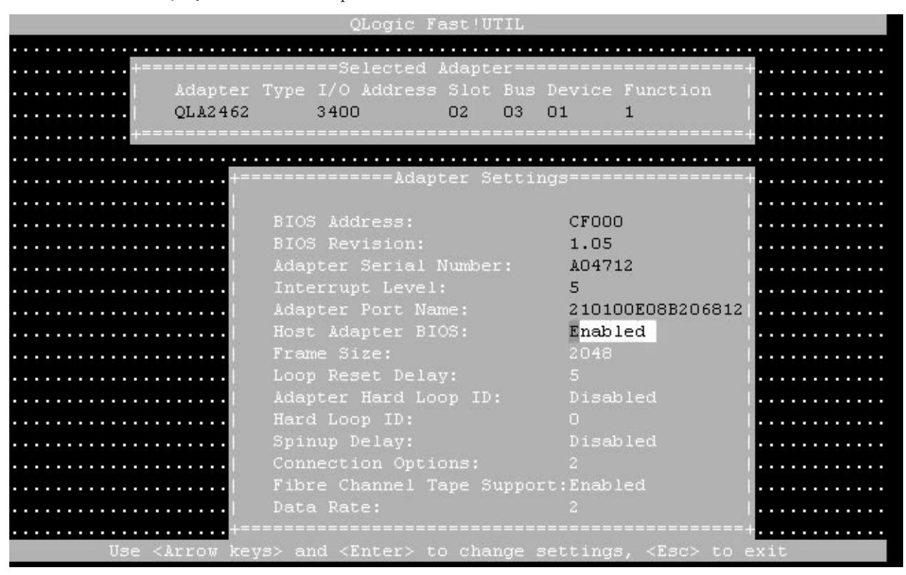
FIGURE 11-1 luxadm display Command and Output

The following Luxadm command output from the example in the figure can be used to map the MPxIO based c#t#d# to the HBA WWN and array WWN: