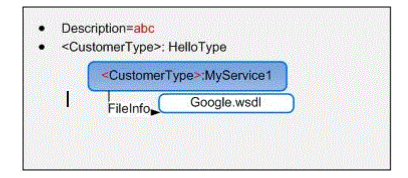
Figure 3–1 Ad-hoc Created Asset View–(Pre-Migration View)

The Data Migration Tool migrates the source asset and artifact file information to new OER 11g Asset Models (Harvested Models), when the file information artifacts are remote and links them with a special relationship (harvester-migrator), for tracking. Here is a sample view of a pre and post migration asset model.