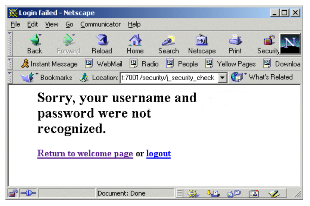
Figure 3-5 Login Error Screen