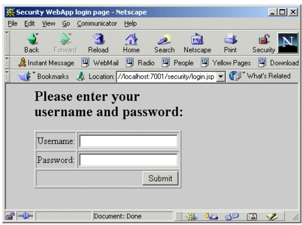
Figure 3-4 Form-Based Login Screen (login.jsp)