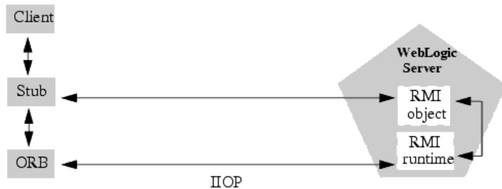
Figure 9-1 RMI Object Relationships